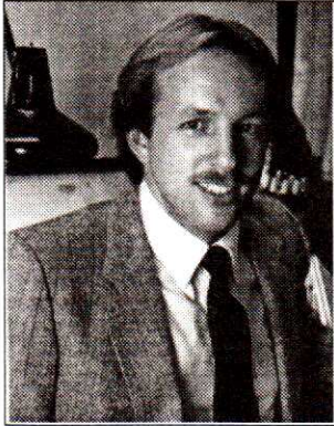
"The Swamp Rabbit"