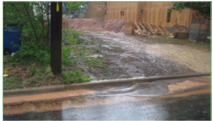
A photo gallery of construction sites without adequate erosion controls (like this one on Oxford) has been posted on the ZNA Web site at www.zilkerneighborhood.org/construction/ .

IF YOU SEE significant amounts of dirt, sand, and mud washed into the street, it's a good bet that the builder at a nearby construction site has not installed the erosion controls required by City codes or is not maintaining them. This